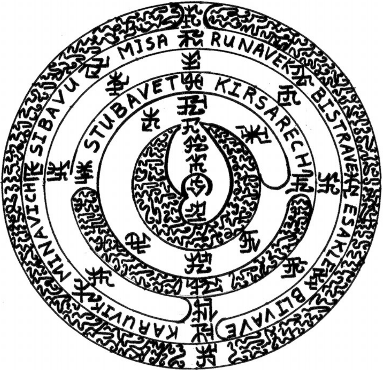
Wheel from Almine, www.spiritualjourneys.com